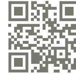
Leopold Hotel Brussels BRASSERIE