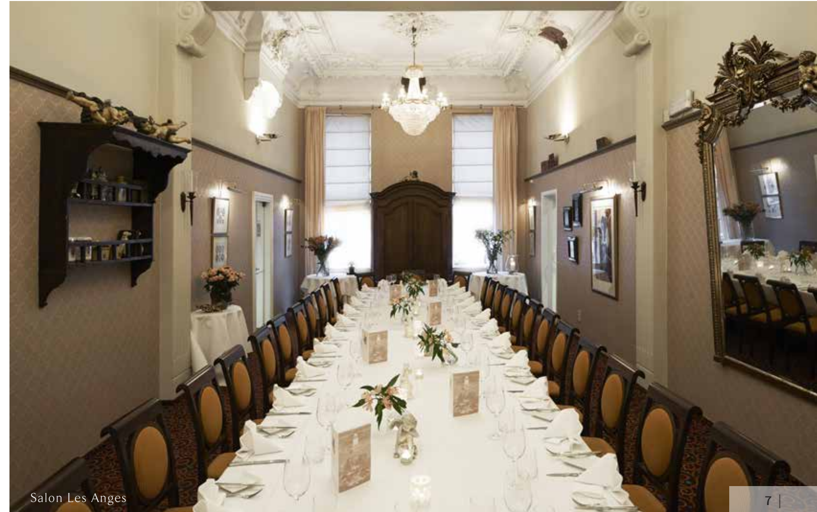
Salon Les Anges